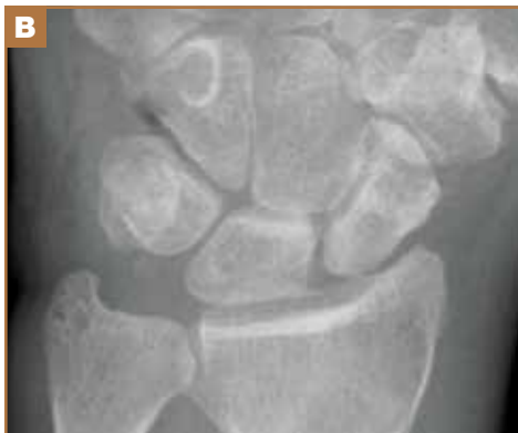
Figure 2. Intraoperative fluoroscopic image (A) taken through the triangle, compared with standard intraoperative plain radiograph (B) taken in the same position.

kg-4 kg. The weights are allowed to hang just above ground level (Figure 1B-1D). Once the setup is complete, the wrist can be positioned in neutral, ulnar, or radial deviation.