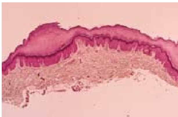
FIGURE 7. Histopathologic findings from a biopsy specimen taken from the left palm consisted of focal depressions of the epidermis occupied by round foci of compact orthokeratotic horny layer.