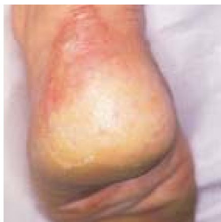
FIGURE 5. Hyperkeratosis extending to the Achilles tendon.