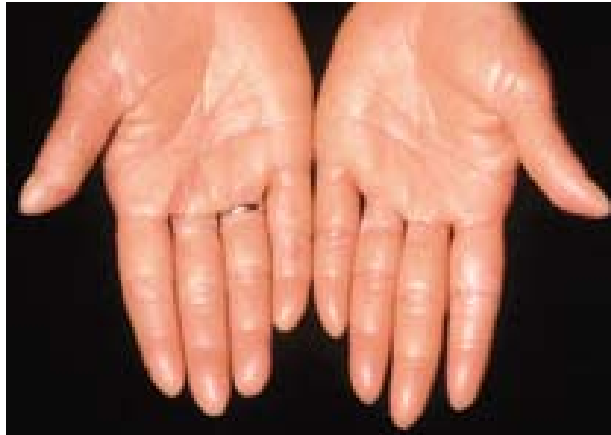
FIGURE 1. Diffuse keratoderma involving the palms.