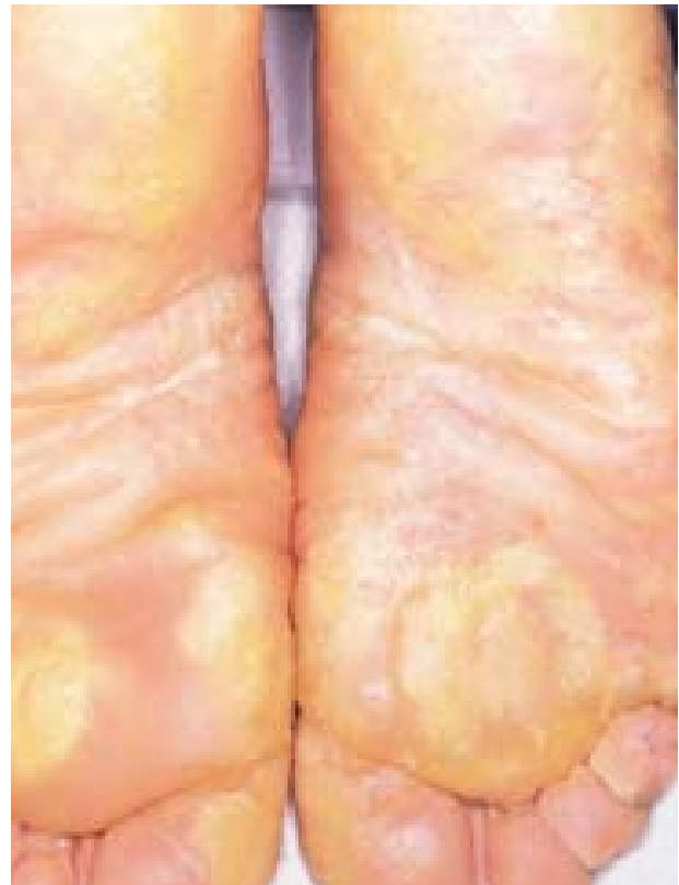
FIGURE 4. Diffuse hyperkeratosis of the soles, with more prominent lesions on weight-bearing areas.

A study of the family pedigree showed a family of 25 members in six generations, with 10 members affected by the diffuse palmoplantar keratoderma (Figure 6). The proband's father was married twice, having affected