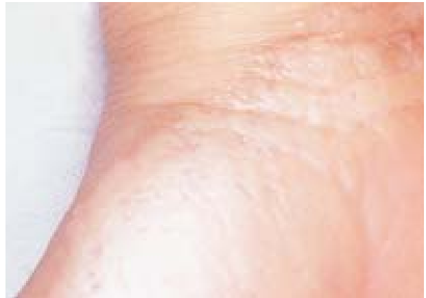
FIGURE 2. Lesions extended to the ventral aspect of the wrists. Confluent keratotic papules can be seen at the border.