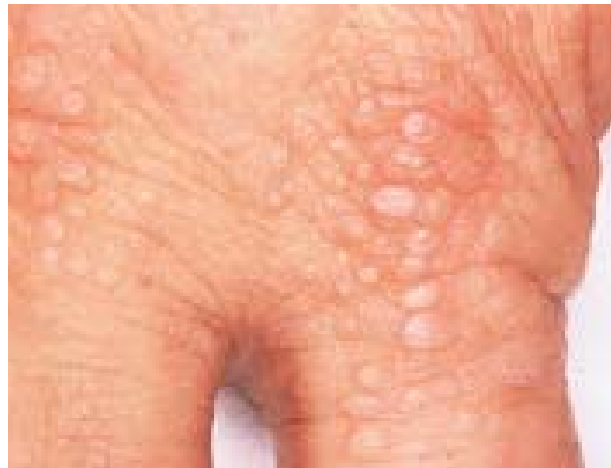
FIGURE 3. Keratotic papules over the knuckles.

hidrosis. Her personal history included Basedow-Graves' disease.