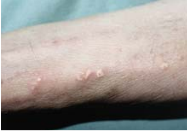
FIGURE 1. Extensor surface of the left arm, with several white-yellow papules in a linear distribution overlying the vein.