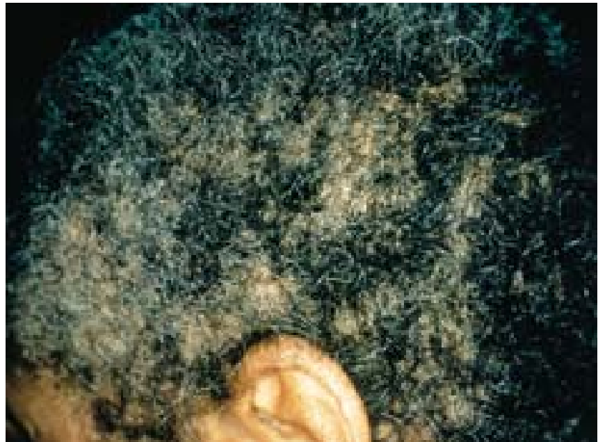
FIGURE 1. Diffuse bogginess and thickening of the scalp associated with patchy alopecia.