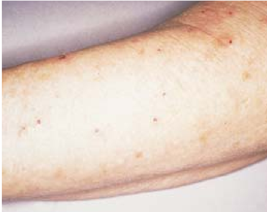
FIGURE 4. Excoriations with eczematous dermatitis on the forearms.

Inasmuch as the pruritus (in patients who experience this symptom) is due to the movement of the mite, antigens on the surface of the mite, or their fecal pellets, the itching and the rash can persist for as long as 2 to 4 weeks after successful treatment (until the mite and its antigens are sloughed off with the dead skin layers). However, most patients experience relief from the pruritus within 3 days. 9