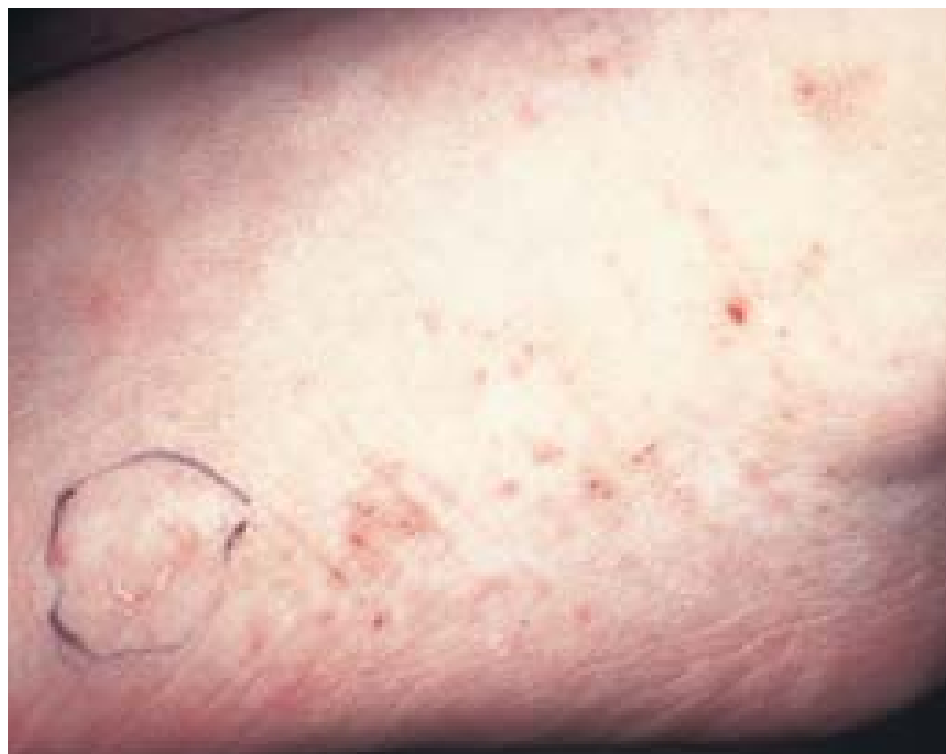
FIGURE 3. A burrow (circled), the pathognomonic lesion of scabies, with surrounding excoriated erythematous papules on a child's foot.

sion occurring mostly within families and among those who spend nights with friends and exchange clothing with others. 9 Indeed, fomites play a significant role in the transmission of scabies—possibly more than direct physical contact.