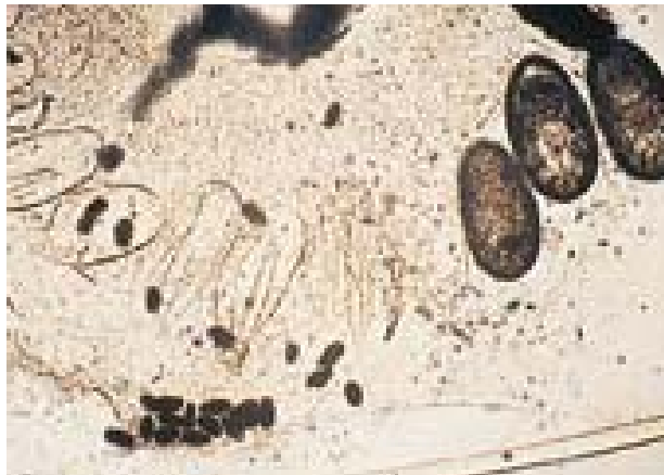
FIGURE 2. Eggs of a scabies mite, hatched eggs (egg casings), and feces (scybala) in a mineral oil preparation. Eggs reveal developing larvae, and the hatched eggs show characteristic longitudinal split.

dition known as Norwegian scabies, millions of mites infest a single host, who clinically demonstrates extensive crusted skin lesions. 5,11 These patients have a defective immunologic response, due to a primary immune disorder or secondary to immunosuppressive agents, causing mites to flourish on the skin surface. Similarly, patients with scabies who are human immunodeficiency virus (HIV)-infected occasionally have their external surface teeming with millions of mites. 10,12,13 Furthermore, some otherwise healthy individuals with no keratotic, crusted lesions are nevertheless heavily infested with mites, and prove to be as contagious as individuals with Norwegian scabies. 5,14 Such patients are designated as having severe scabies. 5 In these three subtypes of patients hosting millions of mites (Norwegian scabies, some HIV-infected patients, and severe scabies), there is minimal pruritus, despite their highly contagious status.