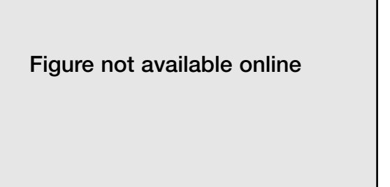
FIGURE 2. A 27-month-old child 5 hours after exposure to peanut shows residual periorbital angioedema initially described as "raccoon eyes."

The diagnosis of peanut allergy is by clinical history and ancillary tests such as the SPT and specific IgE antibody level. Oral challenge with peanut product is confirmatory, but is not recommended due to a small risk of fatal reaction even with prompt treatment. Oral challenge should be done only in a hospital setting by personnel familiar with pediatric Advanced Cardiac Life Support and available emergency airway support. SPT is performed by a small prick with a sharp needle on the forearm at the site of a drop of food allergen. Reactions are measured in millimeters and compared with a histamine and a saline control. SPT is highly predictive of the absence of peanut allergy if negative. Because 30% of subjects who are tolerant of peanut can have a positive SPT,9 a positive result is only supportive of the clinical history, and is not diagnostic in itself. Rarely a negative SPT