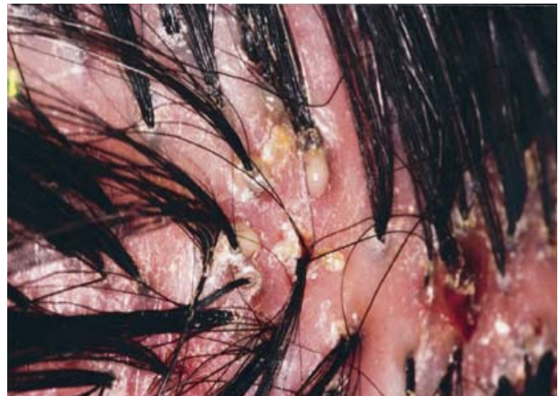
Figure 1. Area of scarring alopecia, with erythema, crusts, pustules, and tufts of normal-appearing hairs.

It occurs in patients of both genders, with a male-female ratio of 2.7:1. In the cases described, patients