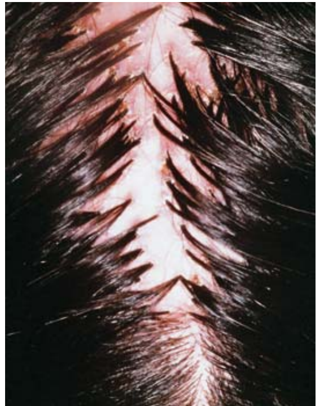
Figure 3. Transition between the central affected area and the peripheral, normal-appearing scalp.

Recently, with the addition of vigabatrin to carbamazepine and phenobarbital (the antiepileptic agents he had been taking previously), better control of the epilepsy was achieved, allowing the patient to