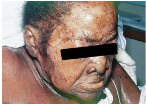
Figure 1. Extensive superficial erosions on the head and neck area.