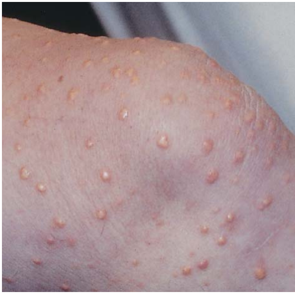
Figure 1. Eruptive xanthomas on the extensor surface of the knee.

48 mg/dL (normal, <130 mg/dL); and high density lipoprotein, 38 mg/dL (normal, 35–55 mg/dL). Fasting blood sugar levels ranged between 102 and 135 mg/dL. The patient denied having any recent chest pain or dyspnea.