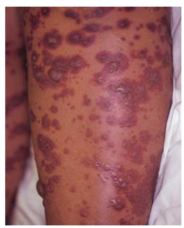
Figure 1. Multiple bullae with surrounding purpura on the thigh.

described in a patient with a history of prior sensitization to ibuprofen, a common household nonsteroidal anti-inflammatory drug (NSAID) with few reported adverse skin reactions.