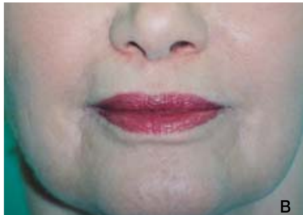
Preoperative (A) and postoperative (B) expanded polytetraflouroethylene implant in upper lip.

developed tunneling devices. These allow for custom molding according to the patient's need. Because the aging process is continuous, touch-ups may be required. The implant technique appears simple. An insertion of the appropriate length, width, and area will help to avoid disfigurement, inflammation, and pouching. Theoretically, there can be displacement and rarely extrusion of the implants; however, appropriate placement avoids these complications.<sup>24</sup>