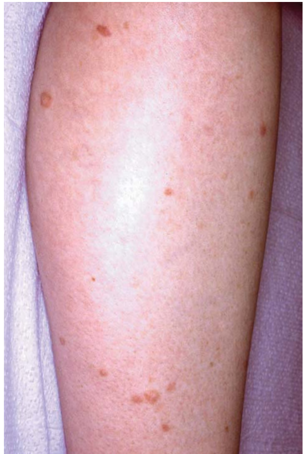
Figure 3. Leg of oldest daughter, aged 46 years.