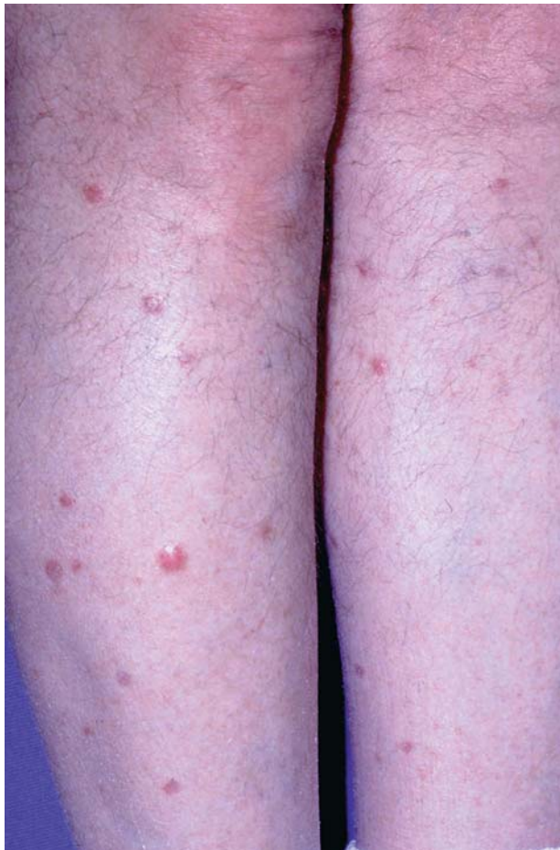
Figure 2. Legs of proband, aged 71 years.