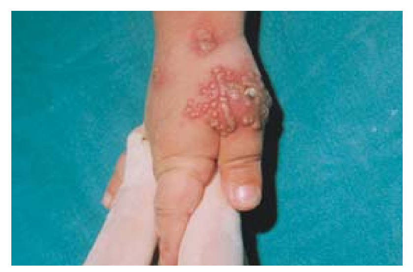
Figure 2. Multiple vesicular lesions on hyperemic background on the proximal phalanx of the right thumb.