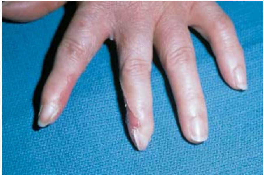
Figure 2. Distal narrowing and nail dystrophy with overlying skin lesions.