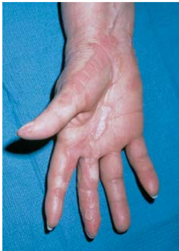
Figure 1. Linear erythematous plaques with central atrophy and raised borders.

A 58-year-old woman presented with a 20-year history of hyperpigmentation and erythematous fissuring of her right hand. Examination revealed linear erythematous plaques with central atrophy and rolled borders on the right palm extending to the palmar and lateral surfaces of the thumb and second and third fingers. The second and third fingers also demonstrated distal narrowing with nail dystrophy and limited extension (Figures 1 and 2). Linear hyperpigmented patches were seen on the extensor surface of her right forearm and upper arm.