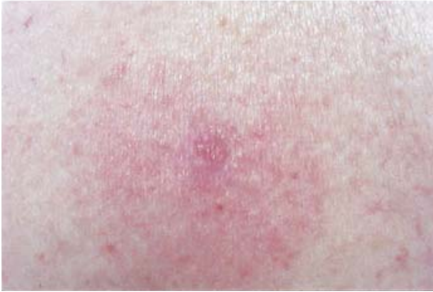
Figure 1. A 4×4-mm erythematous papule on the left upper back.