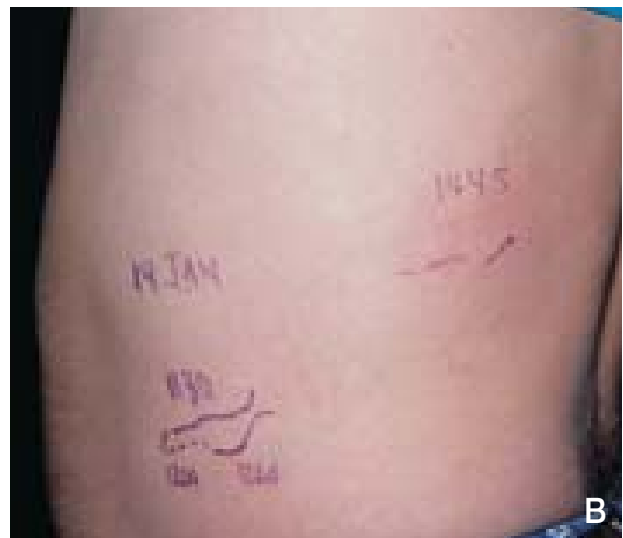
Figure 3. Larva currens position marked at 11:30 AM (blue) and 12:00 PM (red). Ruler indicates distance in centimeters (A). Progression onto the back by 2:45 PM (B).