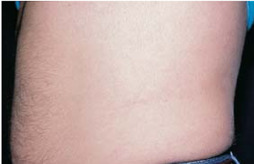
Figure 2. A patient demonstrating the urticarial "burrow" of larva currens.