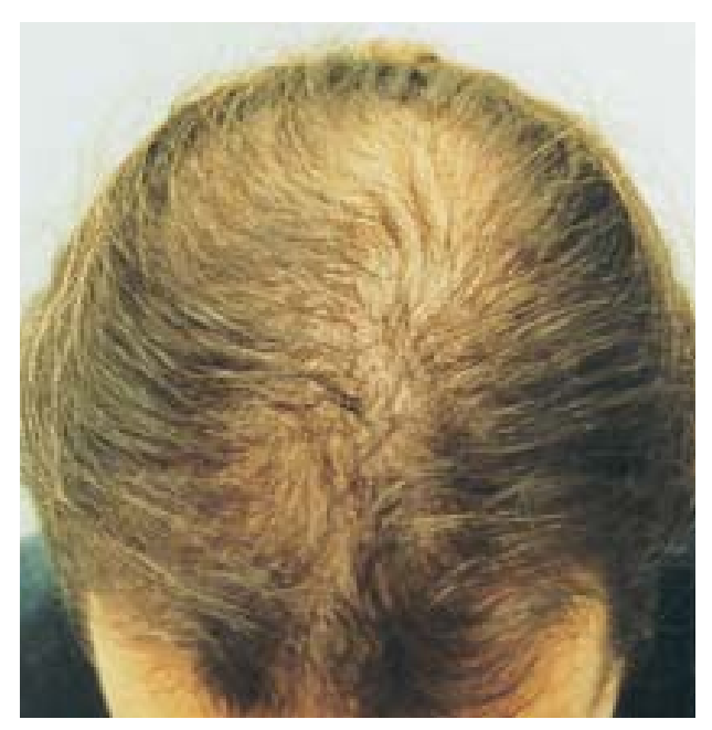
Figure 1. Androgenetic alopecia in an 18-year-old man showing early thinning of frontal scalp and vertex region and accentuation of bitemporal recession.