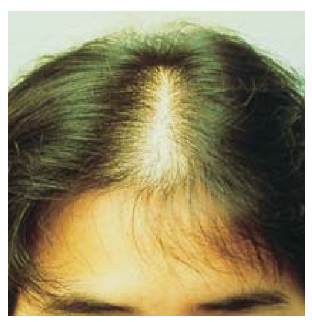
Figure 2. Androgenetic alopecia in an 18-year-old woman with diffuse thinning over the frontal scalp. The frontal hairline is characteristically retained in women with androgenetic alopecia.

physically attractive.<sup>7</sup> These girls revealed that their desire to lose weight stemmed from the influence of the media, their peers, and their desire to be more attractive, gain more attention, and be more confident. Similar influences of the media and peer groups make the presence of thinning hair a source of great distress and insecurity in adolescents.