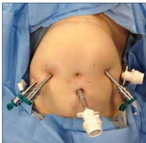
Place the camera port supraumbilically, with two 8-mm robot ports to the left side of the umbilicus and one to the right. Separate each port by approximately 10 cm. Place an assistant port to the far right for passing and retrieving sutures.