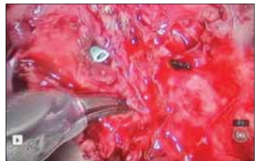
FIGURE 5 Dissect the vaginal wall

Dissect the anterior vaginal wall down to the fistula, and dissect the bladder off of the vaginal wall for about 1.5 cm to 2 cm around the fistula tract.