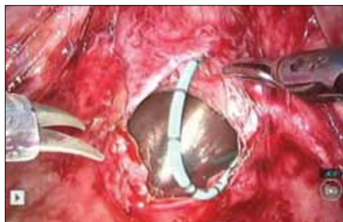
FIGURE 4 Visualization of the fistula stent

The blue stent in the fistula should be visible at the anterior vaginal wall. The larger silver stent, shown here in the vagina, also acts to preserve the pneumoperitoneum.