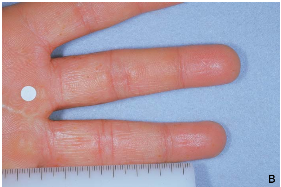
Figure 2. Clinical improvement of a sample patient before (A) and after (B) 21 days of concomitant treatment with clocortolone pivalate cream 0.1% and tacrolimus ointment 0.1%.

differences (P=.048) in the percentage change from baseline by day 14 compared with patients treated with TO alone. The level of erythema by day 14 was similar in the CPC+TO and CPC groups.