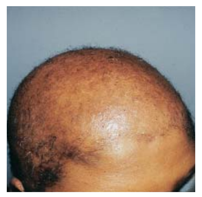
Figure 1. A tonsure pattern of scalp alopecia consisted of a sparse distribution of long and short hairs throughout the scalp, except for a rim of normal-appearing hair at the periphery.