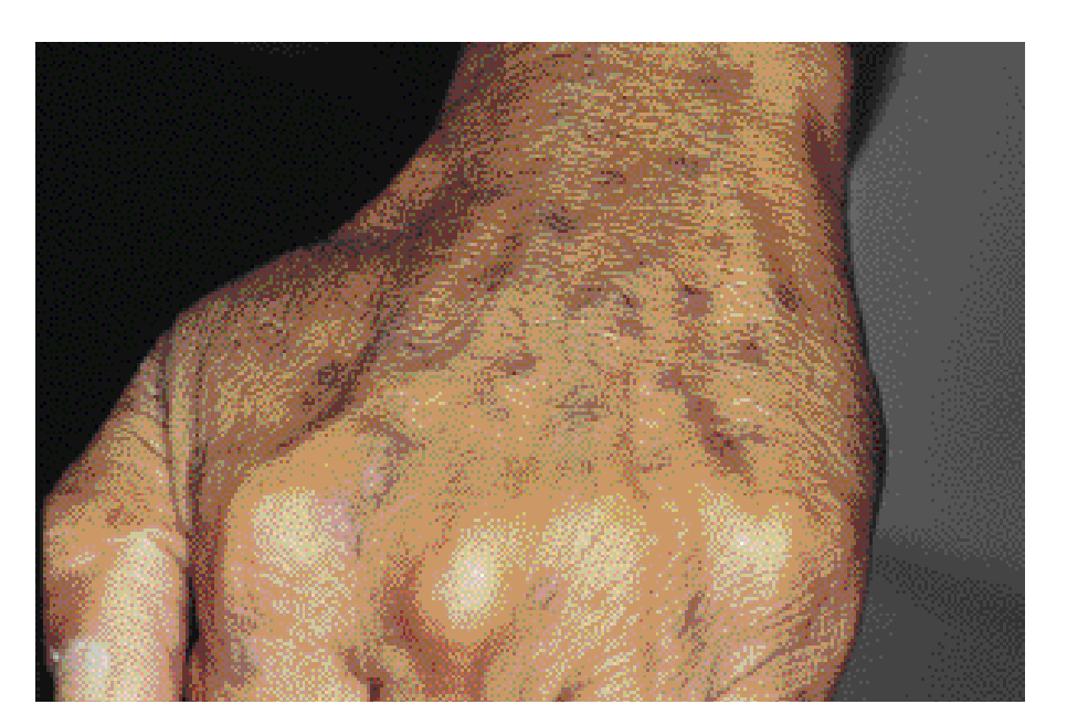
Figure 2. Hyperpigmented macules on the dorsal hand.