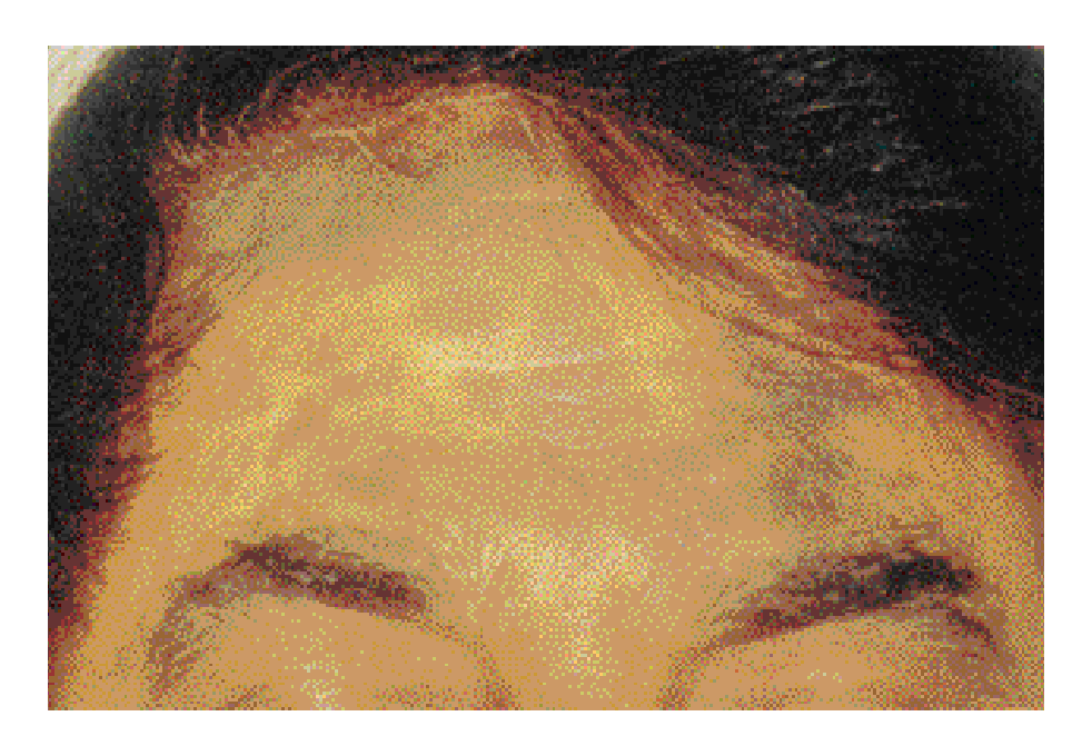
Figure 1. Hyperpigmented macules and patches on the forehead.