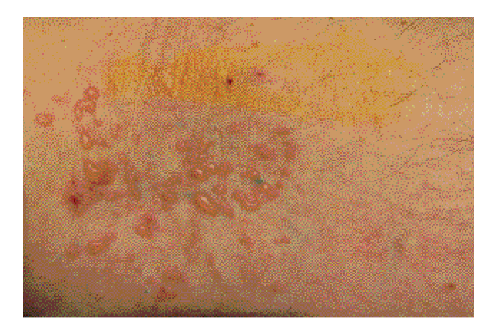
Figure 1. Annularly arranged vesicles on the patient's arm forming a "string of pearls."