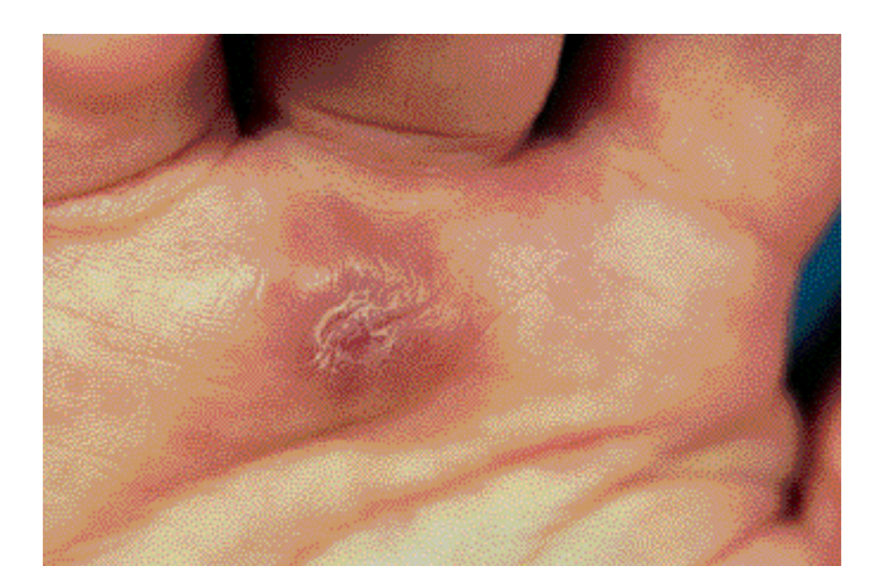
Figure 1. Erythematous nodule on the palm.