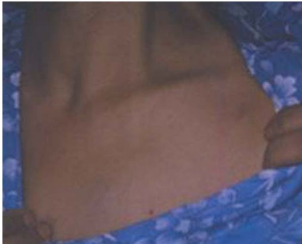
Figure 3. Two nodules above and below the left clavicle.