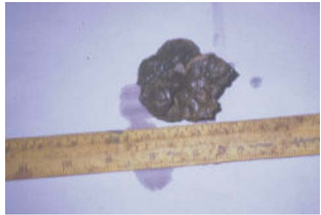
Figure 1. A 5.3×5.3-cm cauliflower mass.

Patient 3 —A 62-year-old woman presented with a mass protruding from her anus accompanied by intermittent constipation and difficulty sitting for one year (Figure 4). She denied rectal bleeding.