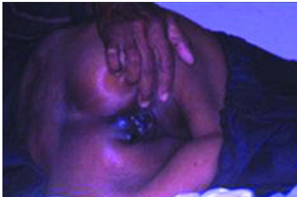
Figure 4. Lesion protruding from the anus.