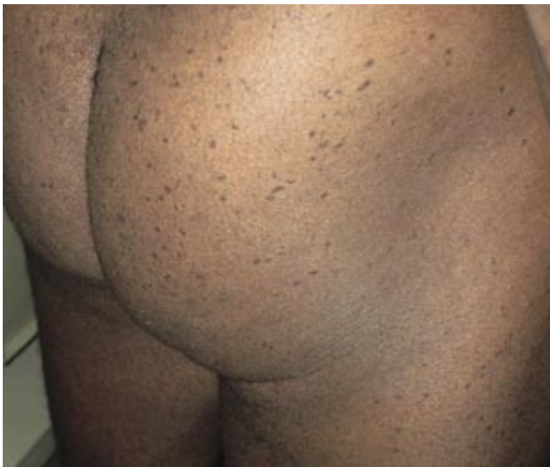
Figure 1. Multiple, symmetric, hyperpigmented papules on the buttocks.

He was not taking any medications and had no other health problems. Findings of the cutaneous examination included numerous 3-mm, symmetric, hyperpigmented papules on the buttocks and upper posterior thighs (Figure 1). The long axis of the lesions tended to be arranged along the skin tension lines, as seen in pityriasis rosea. The other findings of the cutaneous examination were unremarkable. The lesions were discrete, widespread, and without scale, and they did not blanch. Darier sign was absent. The initial