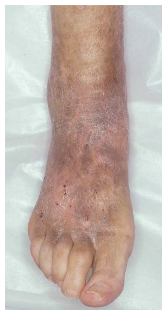
Figure 4. All ulcers completely reepithelialized within 20 days after starting treatment with recombinant human basic fibroblast growth factor.

changes were involved in the pathogenesis of the ulcers in the present case. Results of a radiologic examination revealed the vessels of the patient's legs had marked calcification, which formed a weblike pattern (Figure 3).