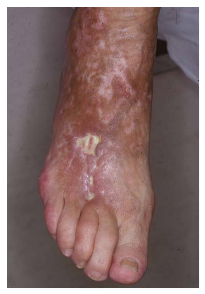
Figure 1. Multiple skin ulcers in systemic sclerosis– dominant sclerotic skin. The ulcers were fingertip sized, appeared deep and punched out, and were covered with necrotic tissue.

factor, platelet-derived growth factor, and FGF. Therefore, we were concerned of the risk of aggravating the preexisting fibrosis of scleroderma in our patient with the application of topical rhbFGF; however, all the patient's ulcers were reepithelialized within 20 days after starting therapy, and no visible recurrence developed during the 20-month follow-up period. This treatment is potentially an important new approach for recalcitrant skin ulcers in the setting of autoimmune collagen diseases.