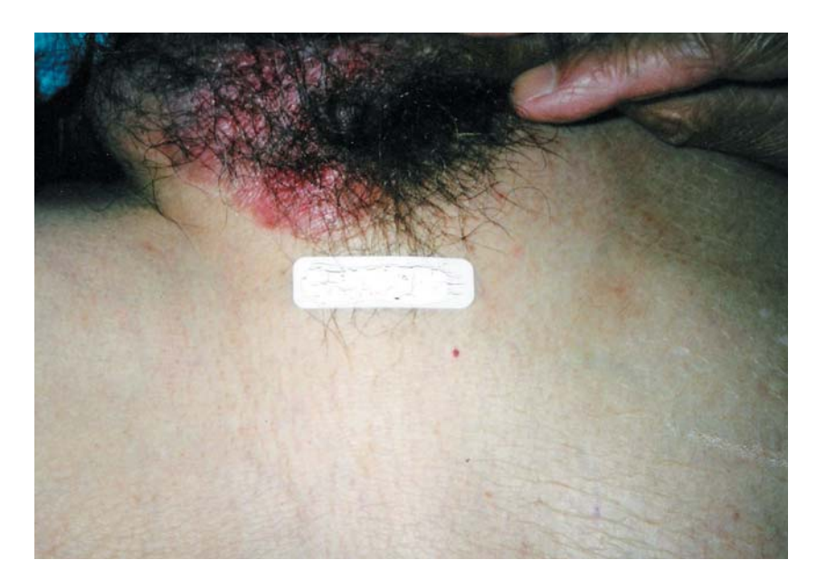
Figure 1. Extramammary Paget's disease involving the scrotum.

The patient was then treated with imiquimod, 5-FU, and retinoic acid combination chemotherapy. The protocol involved applying 5-FU 5% cream every morning, retinoic acid 0.1% gel every afternoon, and imiquimod every evening. After 12 days, the patient complained of severe burning and pain in the affected area, and results of an examination showed severe erosive erythema (Figure 3). At that