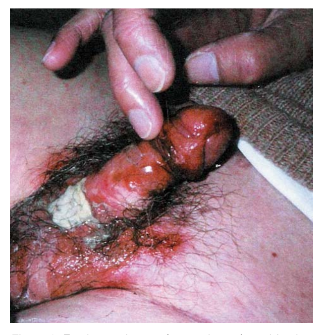
Figure 3. Erosive erythema after 12 days of combination topical chemotherapy.

point, topical chemotherapy was discontinued. Zinc oxide 2% and polysporin ointment were applied alternatively 4 times daily for 2 weeks.