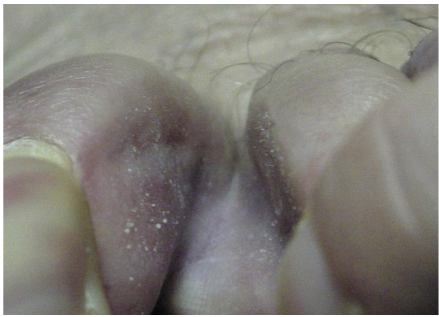
Figure 2. Baseline presentation of tinea pedis. Fine scale and mild erythema of toe web space were noted at the biopsy site.

the development of brisk erythema at and around the biopsy site.