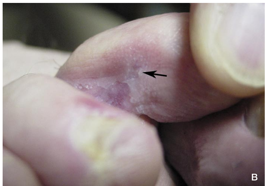
Figure 3. Interdigital web after treatment with imiguimod cream 5% applied once daily (7 d/wk) for 4 weeks and twice daily (7 d/wk) for 2 weeks (A). Solid arrow identifies the original biopsy site. Substantial red interdigital erythema was observed and is marked by the open arrow. Small erosions also were observed in the web space. Complete clearance of webs at one week posttreatment (week 15)(B). Residual web maceration at the site of the previous tinea infection was noted. Arrow indicates biospy site.

infection. The patient was followed clinically every 3 to 4 months, and at 14 months, no recurrence of the nBCC was observed.