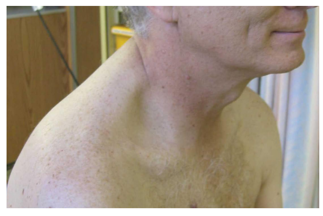
Figure 1. Line of demarcation at the collar.

The presentation of generalized argyria typically begins with gray-brown staining of the gums that progresses to involve the skin diffusely. The mucocutaneous findings in argyria are the results of elevated serum silver levels, which lead to dermal and mucosal deposition of the metal.