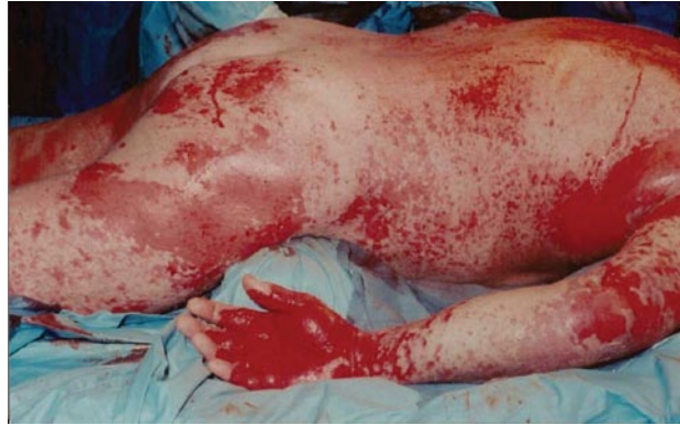
Figure 1. Patient one day after admission to the burn unit. Generalized erythema and a widespread bullous eruption on the trunk, extremities, and scrotum, and several erosions in the intertriginous areas were present.

Histopathologic and DIF Findings —Results of the frozen section biopsies revealed subepidermal