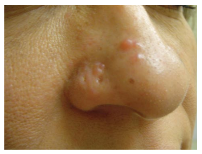
Figure 1. Characteristic skin-colored to pink, well-circumscribed papules on the right nasal ala.

skin-colored to pink, dome-shaped papules on the right nasal ala (Figure 1) and dorsum. A shave biopsy of a lesion on the right nasal ala was performed. Results of a routine histologic evaluation revealed a diffuse basophilic infiltrate in the dermis (Figure 2). The infiltrate consisted of polyclonal B and T cells (Figure 3). The B cells were CD20<sup>+</sup> and T cells were CD4<sup>+</sup> and CD8<sup>+</sup>. In addition, there was a mixed expression of \kappa and \lambda chains within the infiltrate. The patient was diagnosed with cutaneous lymphoid hyperplasia (CLH).