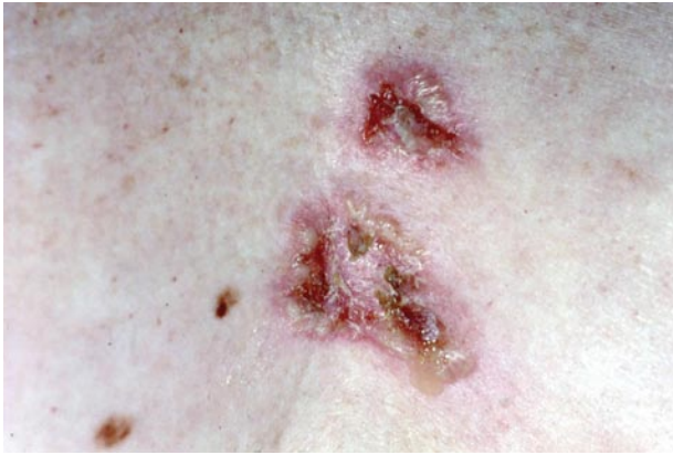
Figure 1. Skin lesions of immunoglobulin A pemphigus. Blisters, some with purulent discharge, were located on the anterior chest.