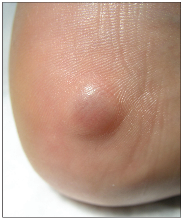
Figure 1. Subepidermal nodule on the medial aspect of the right heel.

A ngioleiomyomas are benign neoplasms arising from the smooth muscle of vein walls.<sup>1</sup> They are typically solitary, firm, subcutaneous nodules<sup>1,2</sup> varying in color from pink to blue to brown (Figure 1).<sup>3</sup> They grow slowly and generally are less than 3 cm in diameter at the time of excision