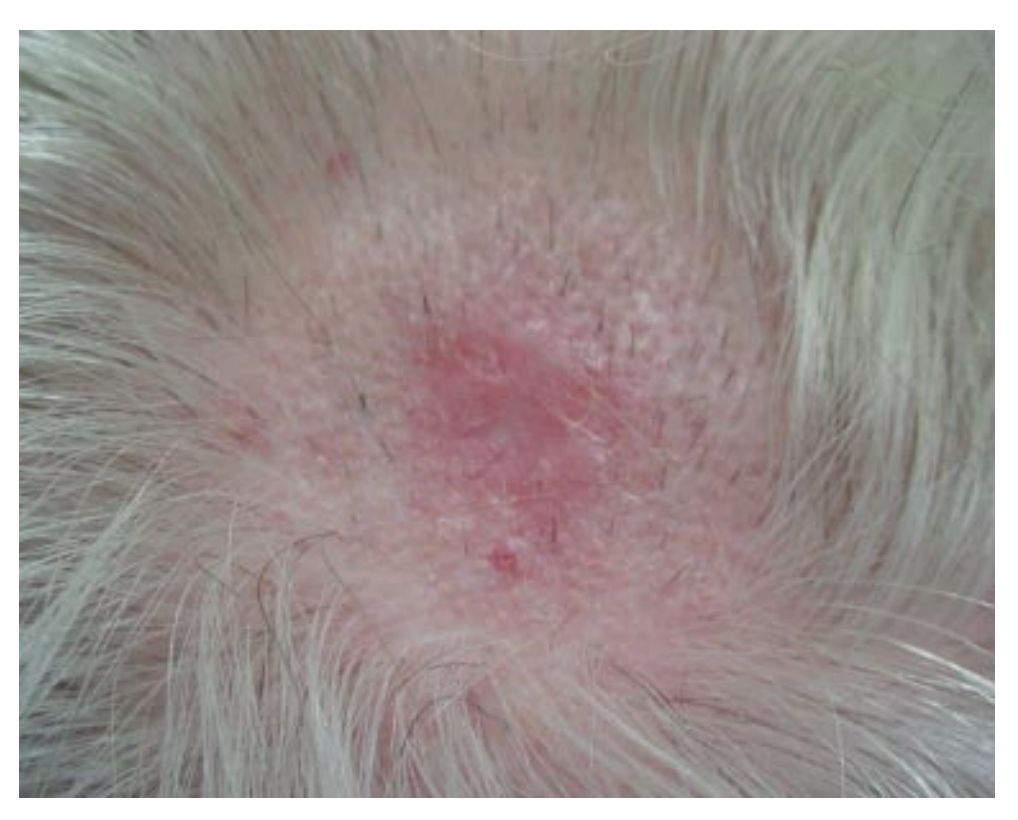
Figure 1. Pink and flesh-colored lesion (20 \times 11 \text{ mm}) in the midline parietal region of the scalp with alopecia over the nodule.

The clinical course is commonly complicated by local recurrence.