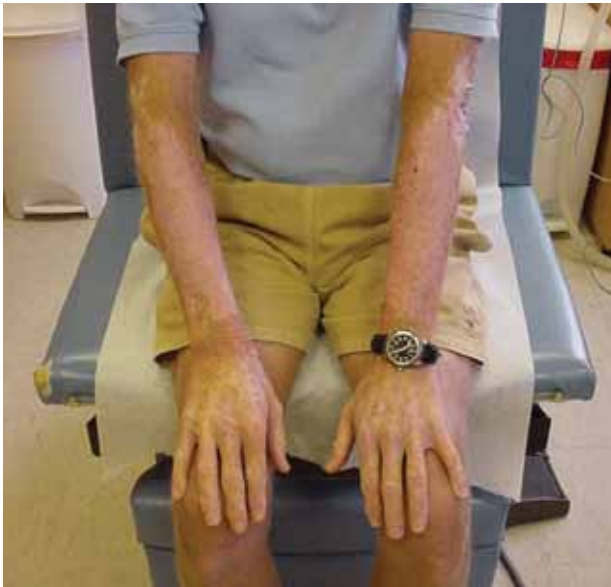
Figure 2. Sclerodermatous skin changes on the forearms. The skin biopsy was taken from this area.

urine porphyrin collection showed the following: uroporphyrin, 4028 \mu\text{g}/24\text{ h} (reference range, <20\text{ }\mu\text{g}/24\text{ h} ), heptacarboxyporphyrin, 3921 \mu\text{g}/24\text{ h} (reference range, <13\text{ }\mu\text{g}/24\text{ h} ), pentacarboxyporphyrin, 508 \mu\text{g}/24\text{ h} (reference range, <5\text{ }\mu\text{g}/24\text{ h} ), and coproporphyrin, 192 \mu\text{g}/24\text{ h} (reference range, <110\text{ }\mu\text{g}/24\text{ h} ). Direct immunofluorescence of the involved skin from the dorsal aspect of a hand showed IgG, IgA, IgM, C3, and fibrinogen vascular staining. Results of a routine skin biopsy of a blister were diagnostic of porphyria cutanea tarda (PCT). The patient was sent to the dermatology grand rounds at the Indiana University School of Medicine, Indianapolis, where he was examined and evaluated, and the diagnosis of PCT was confirmed. The patient stated in retrospect that his urine was occasionally burgundy in color during the last 2 to 3 years.