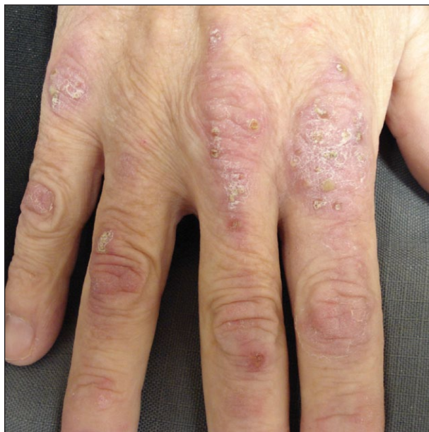
Figure 1. Right dorsal hand with pink plaques with minimal scale and pustules.

Biopsy of an elbow plaque showed confluent parakeratosis with Munro microabscesses and psoriasiform epidermal hyperplasia with broad-based rete ridges, all consistent with classic psoriasis. The lesions on the dorsal hand demonstrated parakeratosis, psoriasiform epidermal hyperplasia