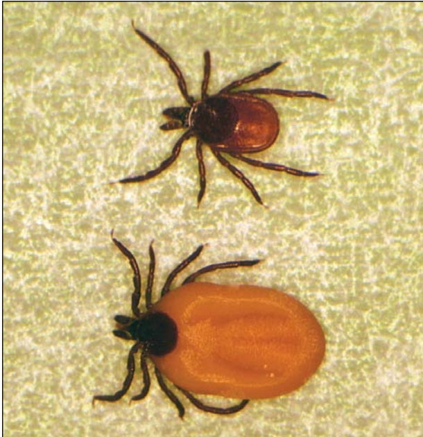
Figure 2. Nonengorged (top) and engorged (bottom) female Ixodes ticks.