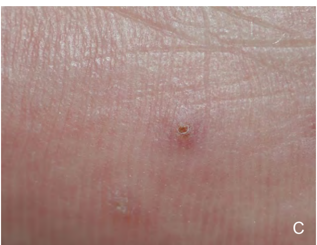
Figure 1. Papules with a central keratotic core and surrounding telangiectasia on the sole of the left foot (A-C).