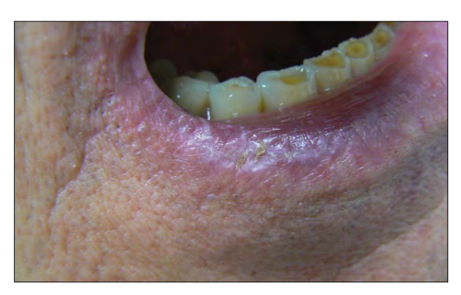
Figure 1. A slightly erythematous-pink hyperkeratotic plaque on the lower lip that occasionally burned.

Oral lichen planus lesions that most commonly undergo malignant transformation include the atrophic-erosive form and plaque forms.<sup>14</sup> It is important to consider malignant transformation in isolated LLP due to the aforementioned possibility of LLP as a precocious form of OLP. Following the international consensus meeting in March 2003, Lodi et al<sup>17</sup> also analyzed 3 large-scale retrospective studies and found that OLP progressed to cancer in fewer