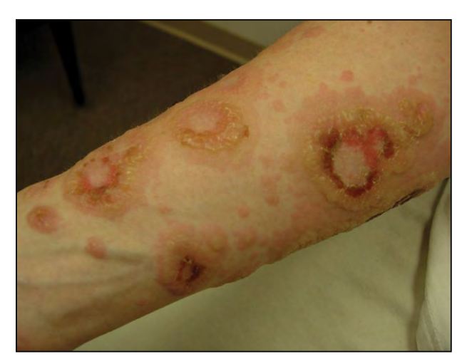
Figure 2. Urticarial plaques with multiple bullae and vesicle formation on the right anterior forearm.