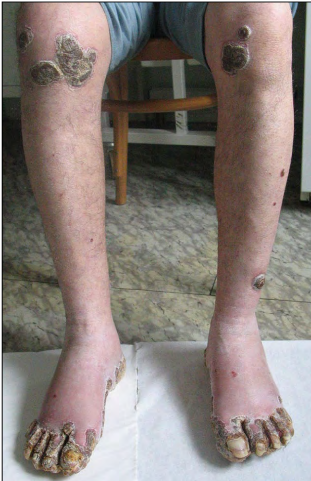
Figure 1. Plaques covered with thick adherent crusts on the legs and feet.