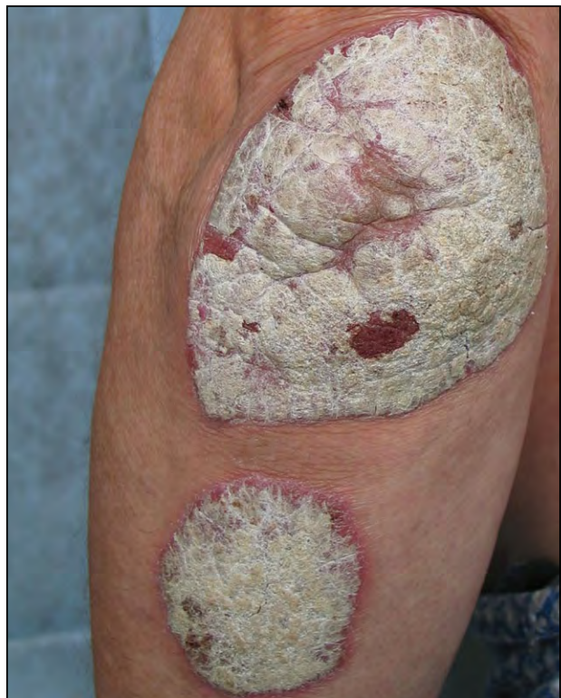
Figure 4. Psoriasis ostreacea with thick scale that typically takes on a concave appearance.