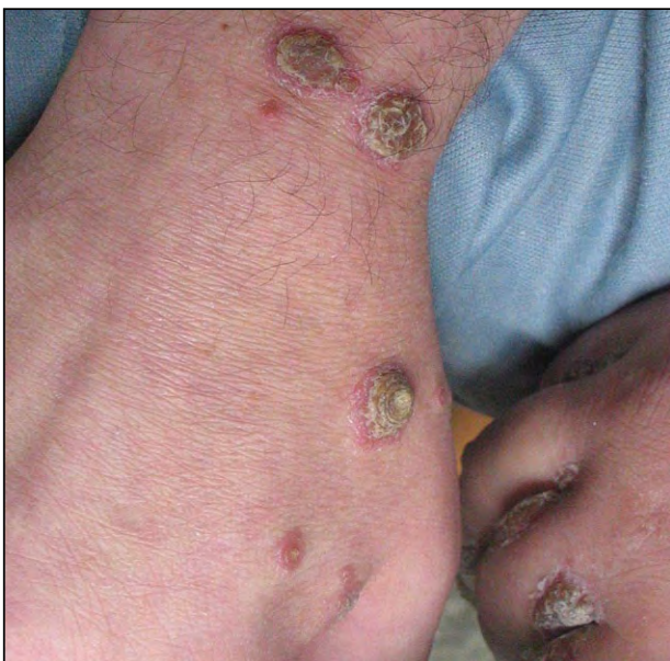
Figure 2. The classic appearance of conical ringlike crusts of psoriasis rupioides resembling the outer surface of a limpet shell.

In the 1960s, the differences between the rupioides and ostreacea variants were described. 6,7 The authors pointed out typical features of psoriasis ostreacea, including layers of visible scales, often in