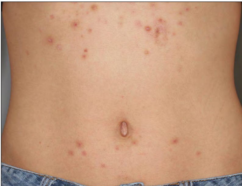
Figure 1. Comedone-like red-brown papules on the mid upper abdomen.

manner. 4-6 Vellus hair cysts may be associated with renal failure, 7 pachyonychia congenita, 8-10 ectodermal dysplasia, 11 cardio-facio-cutaneous syndrome, 12 and Lowe syndrome. 13 There are many reports of vellus hair cysts occurring concurrently with steatocystoma multiplex, and there may be histologic overlap. 14,15 In one study of 64 cases of steatocystoma multiplex, 27 (42%) contained vellus hairs. 14 Patients with pachyonychia congenita may present with both lesions. 9 However, one group found