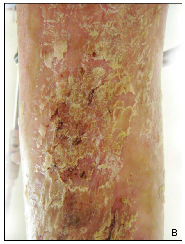
Figure 1. A mass on the lateral aspect of the right foot showing a verrucous erythematous surface (A). Diffuse erythematous plaques covered with yellow waxlike scaling resulting in a distinctive ichthyosiform appearance also were present (B).

mucous membrane or facial involvement or alopecia were noted. Development and intelligence were appropriate for age with good school performance. Moreover, a complete systemic workup showed no associated visceral involvement.