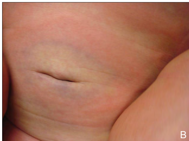
Figure 1. Urticaria multiforme with annular, arcuate, polycyclic, erythematous wheals present on the patient's trunk, thighs, hands, and feet (A and B).