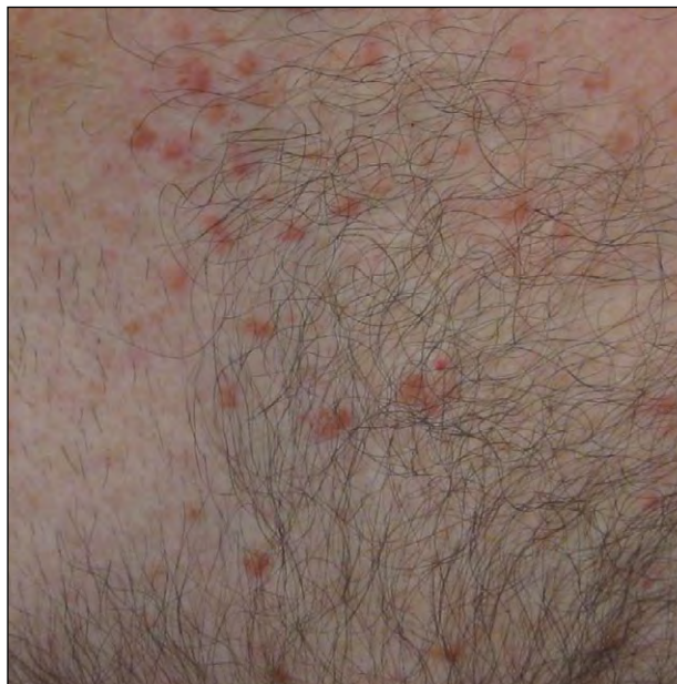
Figure 1. A pseudovesicular eruption over the chest.

The etiology of Leser-Trélat sign is proposed to be the release of tumor products that act on epidermal