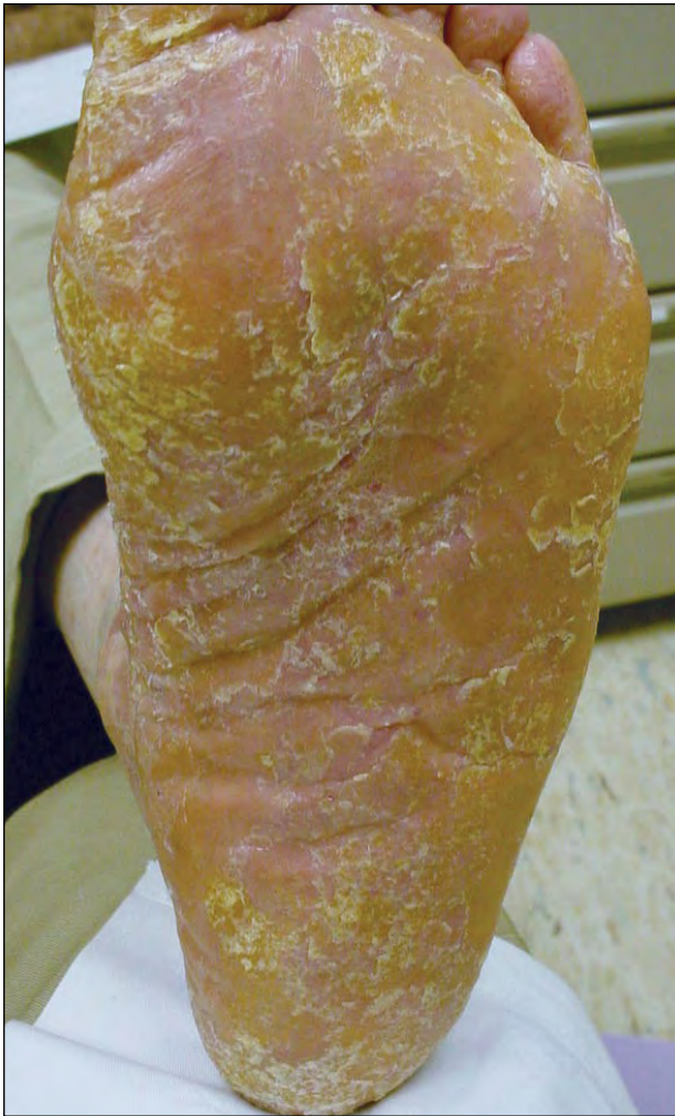
Figure 1. Initial clinical appearance of Woringer-Kolopp disease mimicking chronic dermatitis on the left foot.