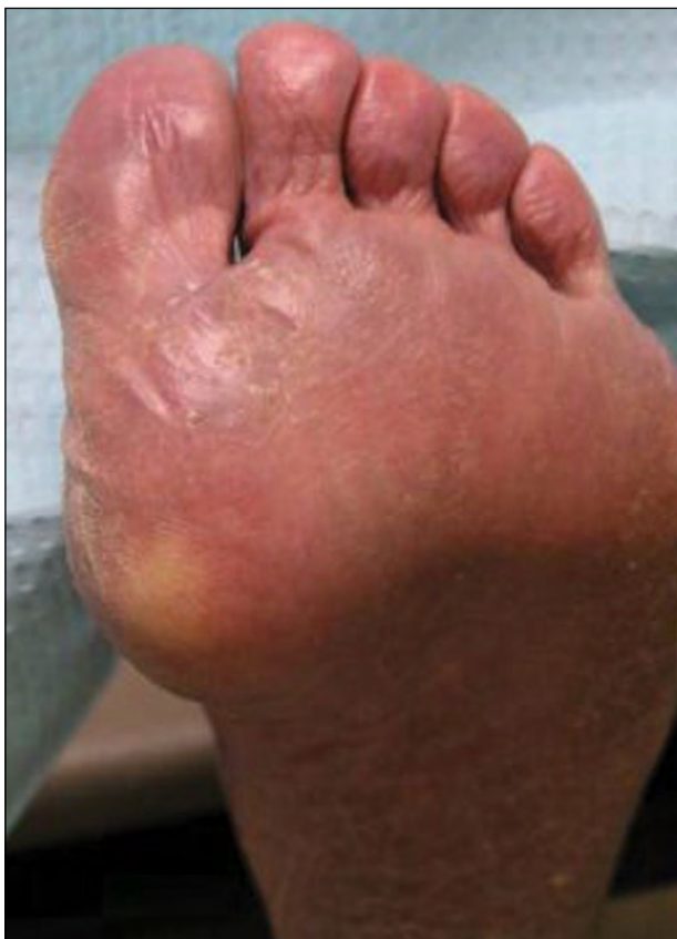
Figure 4. Clinical appearance after treatment with topical bexarotene. The patient had residual lesions after 8 years of follow-up.

Effective treatments of Woringer-Kolopp disease include topical nitrogen mustard therapy, localized radiation therapy, and phototherapy using either