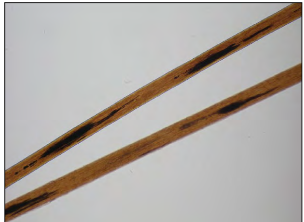
Figure 4. Spindle-shaped dark bands, occupying 40% to 80% of the hair shaft diameter.