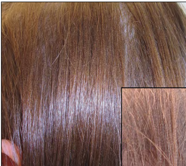
Figure 1. Spangled and lackluster appearance of hair on clinical examination. Handheld magnification revealed light and dark banding of hair (inset).

The patient was diagnosed with pili annulati. Gentler hair grooming practices were encouraged, with a reduction in the frequency of blow-drying. Hair weaving and other styling methods that required twisting or traction were discouraged. At a follow-up visit 2 months later, her hair was a darker brown, and although she had cut her hair, the hair of the parietal scalp appeared less sparse (Figure 5). She confirmed that she had discontinued hair bleaching and was grooming her hair with greater care.