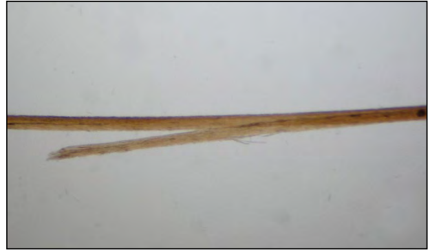
Figure 2. Trichoptilosis observed on light microscopy.