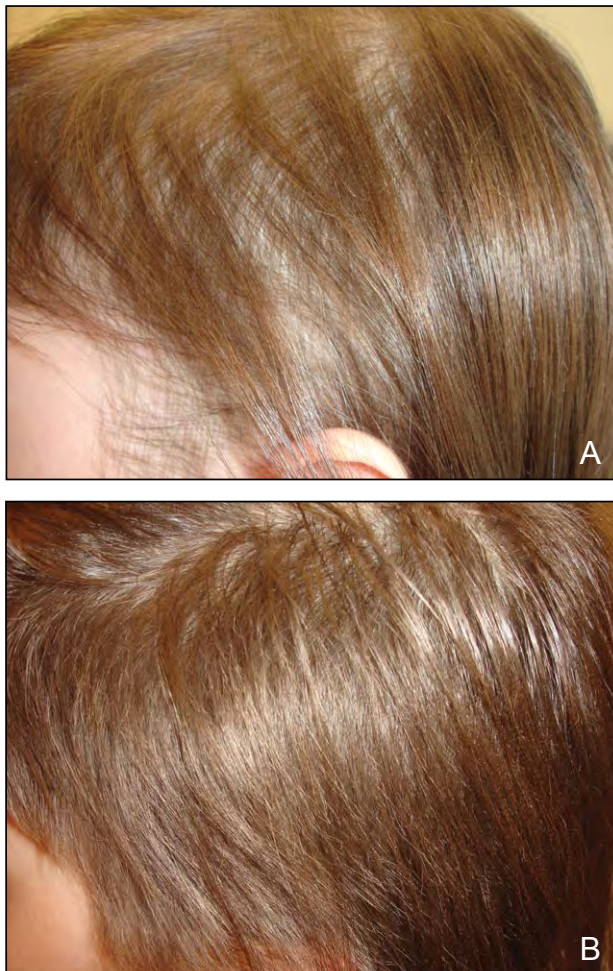
Figure 5. A patient with pili annulati before (A) and after gentle hair care modifications (B).

matrix formation, and a defect in the assembly of structural proteins in the extracellular matrix. 1,4 None of these hypotheses have yet to be convincingly supported. Studies of cytokeratin expression have shown no difference in the immunohistochemical staining intensity and pattern in affected hairs of pili annulati versus controls. 1,4 Alterations in the basement membrane zone, which plays a crucial role in the signaling required for cell differentiation and structural organization in hair growth, have been found using transmission electron microscopy and immunohistochemistry. 3 Further studies of the pathogenesis of pili annulati clearly are required.