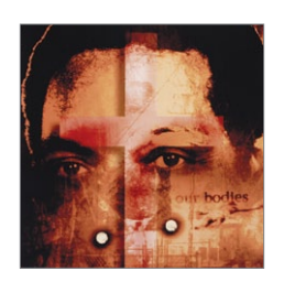
Delusions with religious content