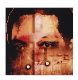
Delusions with religious content