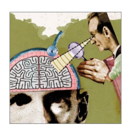
Getting ready for DSM-5