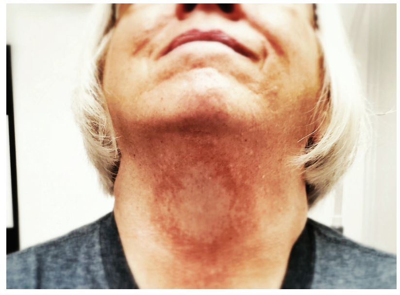
c) Poikiloderma of Civatte d) Dermatoheliosis